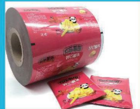
Printed Rollstock Film With Various Materials