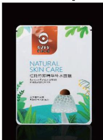
Aluminum foil bag