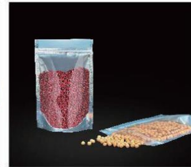
Aluminizing back clear front Doybag