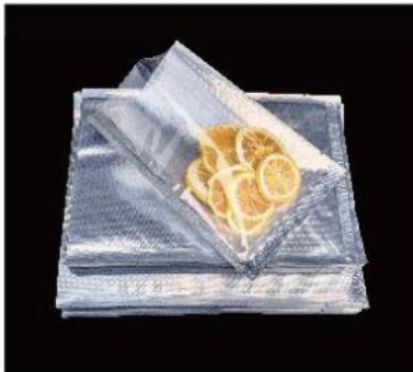
Clear-Aluminizing three sides sealed