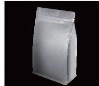
AL foil side gusset&stand-up bag