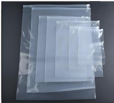
LDPE ziplock bag