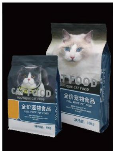
Eight side sealing bag