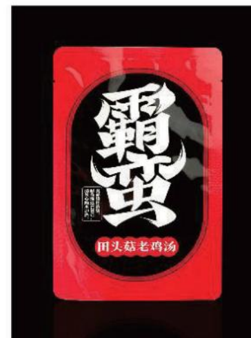
Aluminum foil cooking bag