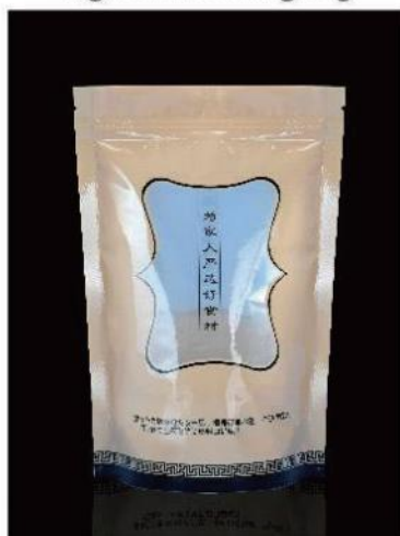
Back clear front stand up bag