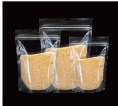
Transparent stand-up bag